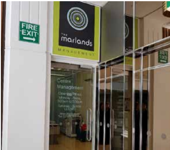
Centre Management Office