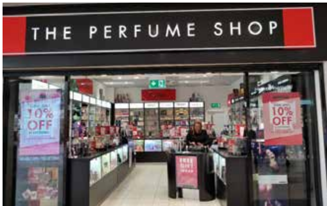
The Perfume Shop

To help you, or the person you are with, navigate around the shops here are some pictures of four of our largest stores and attractions in the centre, that you can use as signposts.