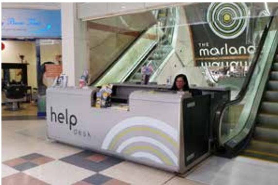
Visitor help desk