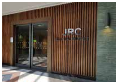
JRC Global Buffet