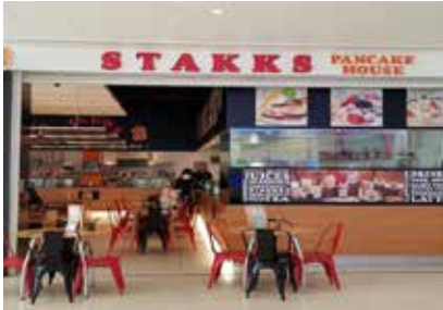
Stakks Pancake House

Packed lunches are welcome in the centre and we have seating available in the mall.